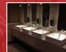
Wet Areas Waterproofing