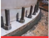
Grouts & Anchors