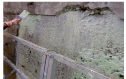
Nitobond EP bonding agent applied on prepared substrate

All honeycombs and voids in concrete were effectively filled and closed with Renderoc HS Xtra, that aided in effectively sealing the joint between the old dam portion and the extended portion above it, along the length of the entire dam.