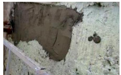
Renderoc HS Xtra repair mortar application