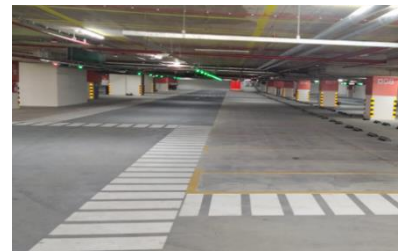
Two wheeler parking area

Concrete floors, if not over coated, generate dust, apart from damaging the joints. Trafficguard UR150 system provides an aesthetic, dust-proof, abrasion resistant high-performance coating providing long-term durability.