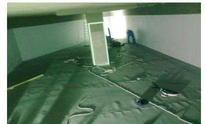
Proofex OGP water containment system inside the tanks

The solutions provided by Fosroc for the two structures were cost-effective, focusing in both on long-term durability, technical compatibility and practicality. Moreover, Fosroc’s service quality was highly appreciated by the project consultant and it was, as he describes it, always there as a reliable source of solutions for his problems.