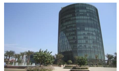
Al-Turki Business Park is a landmark Office Complex in the city of Dhahran