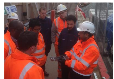
Training session for installers