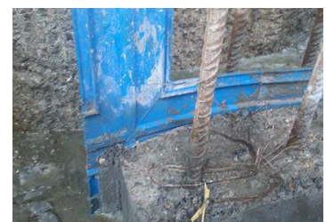
Supercast PVC installed on C340 Victoria Dock