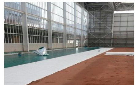
Proofex Total being used under an indoor football pitch

Fosroc professionalism, technical knowledge and delivery for this project has resulted in securing further contracts, including other contractors having seen the work delivered at Manchester City Football Club.