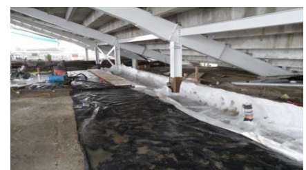
Proofex Total being used under the stands