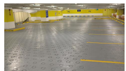
Car park after refurbishment