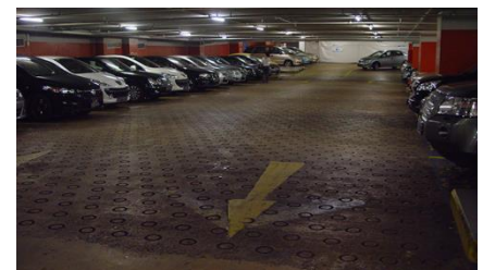
Before the car park refurbishment

Participation in contributing towards the "Green Mark" awareness program in the local building community through certification of qualified "Green Label" products system.