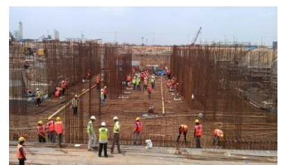
Heavy reinforcement placed over Proofex Engage