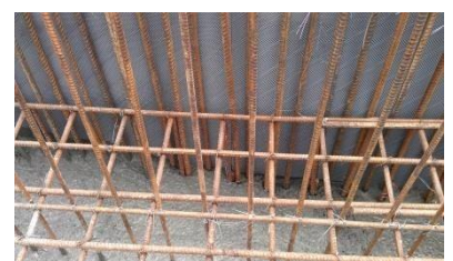
Concrete under progress over laid Proofex Engage